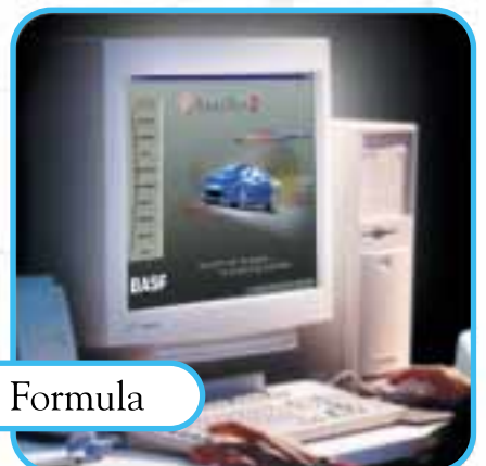
2. Find Formula