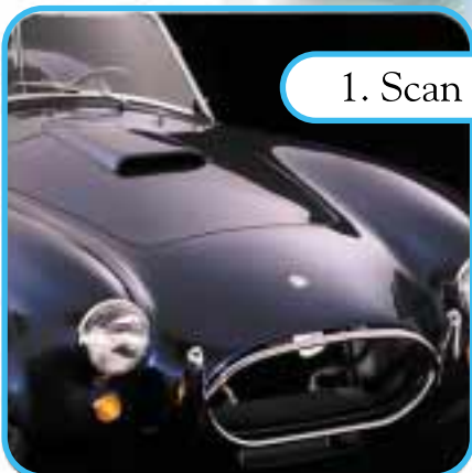
1. Scan Vehicle